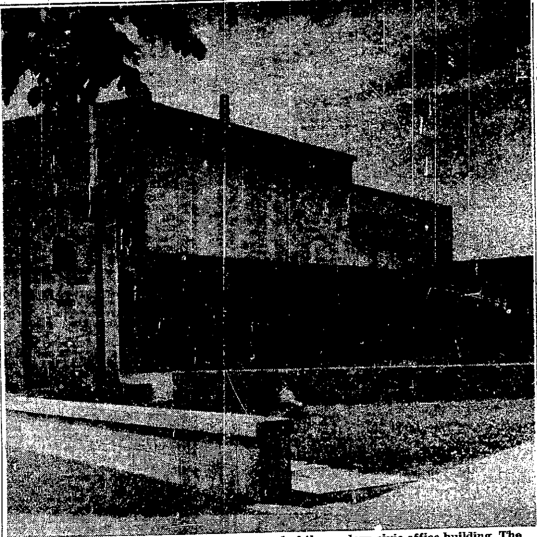
Residents of East Kildonan are proud of the modern civic office building. The city's cenotaph is in the left foreground.