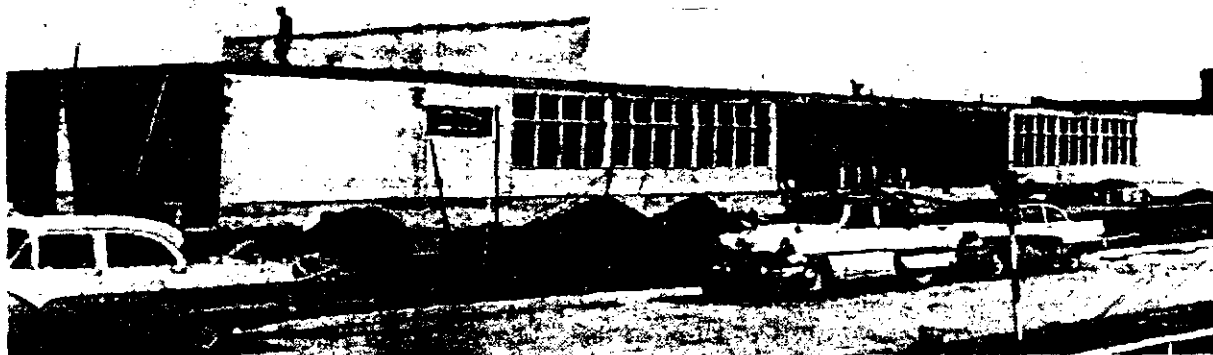
MORSE PLACE JUNIOR HIGH SCHOOL (suggested name)