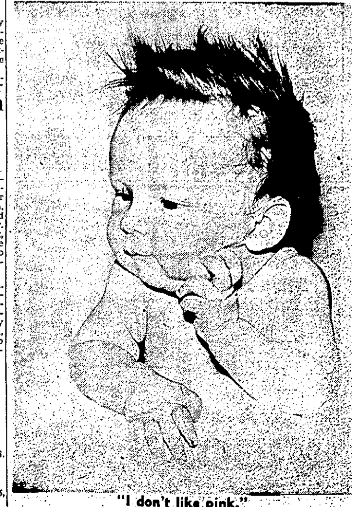
"I don't like pink."