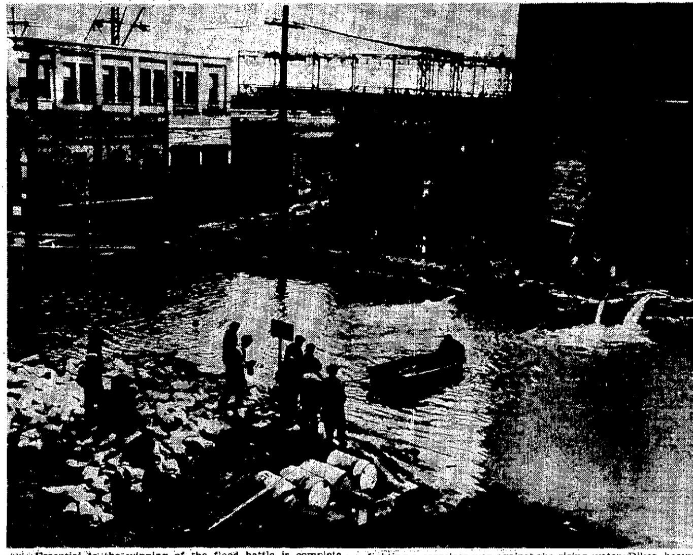
Essential to the winning of the flood battle is complete maintenance of power feeder lines throughout the city and right in the front line of the river's attack is the Mill street sub-station (above) where service men and volunteers are fighting a ceaseless war against the rising water. Dikes, heavy duty pumps and other flood-fighting equipment are being used to protect vital dynamos and transmission circuits.

Here is the breakdown for the three services: Army: Working now, 1,020; en route to Winnipeg or on reserve force call-up lists, 1,290. Navy: Working now, 300; en route to city, 84. Air Force: Working now, 400. The army total does not in-