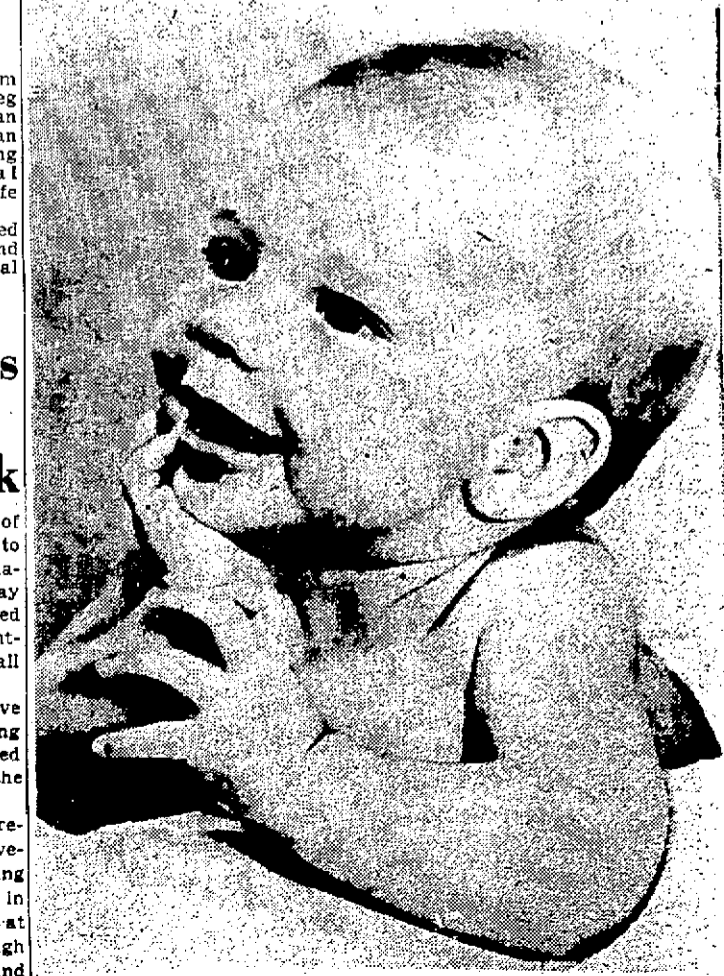
"Oh Donald . . . You're magnificent."